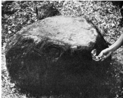
Fig. 2 Stone turtle head found in Izapa and compass needle pointing to the snout (Reproduced from Nature 259 (1976) 390).